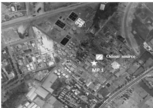
Figure 3. Site 2. Pharmaceutical and chemical industry. Odour source area and odour measurement point (MP 1).

In the Site 2 the modified field investigation method was demonstrated inside the industrial area, near to pyridine plant number 2. Distance to plant was about 50 to 70 meters. Odour quality was solvent and sometimes mixed with ammonia. Participants observed odour intensities according to method for 10 minutes. Only one measurement point was recorded due to extremely high temperatures which made it impossible to have more measurement points.