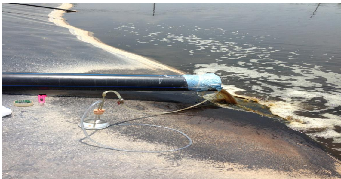
Figure 1: Gas sample collection from the end of a leachate pipe at the semi-aerobic sanitary landfill site.

driven through the cork stopper. The funnel was placed over portions of the leachate collection ponds from where gas was seen bubbling (Figure 3), gas pressure was allowed to build up within the funnel for 24 h and then slowly filled the gas sampling bag. The collected gas was characterized to ascertain its constituent composition.