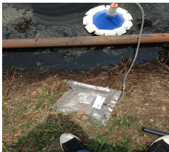
Figure 2: Set up of apparatus used for gas sampling at the leachate collection pond surface