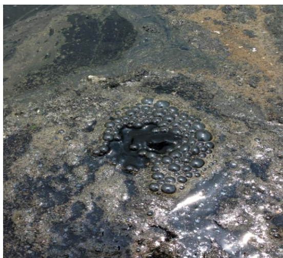
Figure 3: Gas bubbles in leachate pond from which gas sampling was done