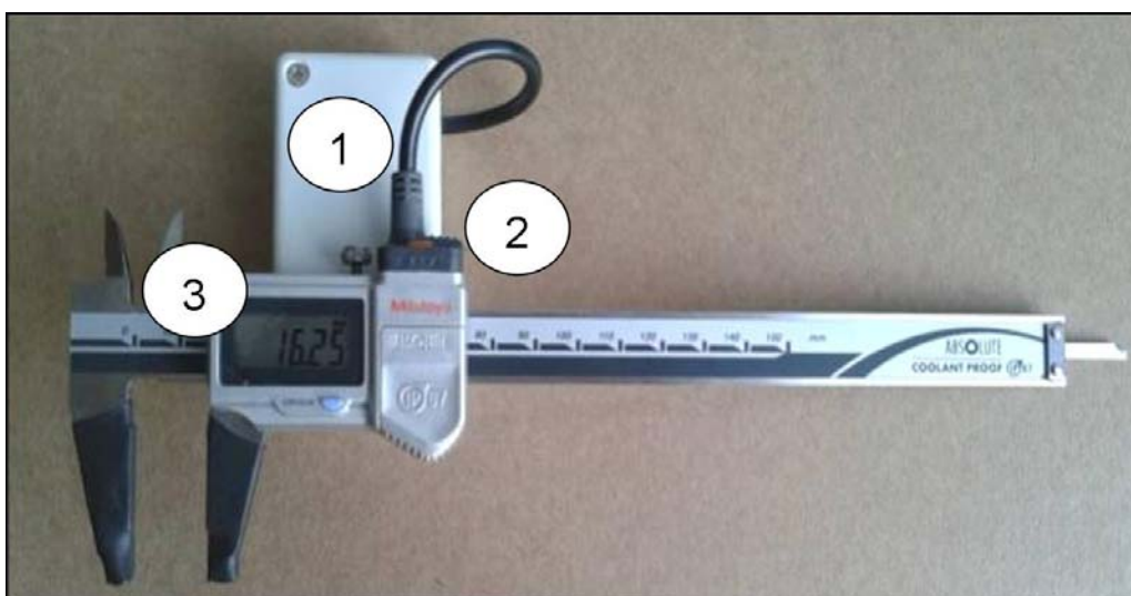
Figure 2. Digital Caliper with onboard datalogger (Calibit). 1Datalogger; 2Recording Button; 3 Data display

where W is the fruit weight in grams, D is the fruit diameter expressed in millimetre and a and b are parameters specific to Pink Lady®. These parameters were obtained in 2007 by regressing diameter and weight data from a large number of fruit picked during the whole season; the R^2 of the relationship was > 0.99 . The same equation allows forecasting fruit distribution in size class categories both in percentage (table 2) and t/ha (table 3). This was done according to the commercial standards, which increase by 5 mm, starting from 65 mm to 90 mm, was also assessed (table 2 and 3). The data for this paper was analysed comparing predicted values with real orchard production data using as a variate the different years applying respectively the glimmix procedure and a Mixed model analysis. Crop load was assessed by fruit counts on the last measurement performed in August, following the protocol described by Manfrini et al. (2009). The crop load (number fruit/tree) was 106, 160, 67, 161, from 2010 to 2013 respectively. The multiplication between the expected fruit size at harvest obtained in the last measurement prediction (table 1), the crop load and the tree density, permit predicting the orchard production of the current year (table 2).