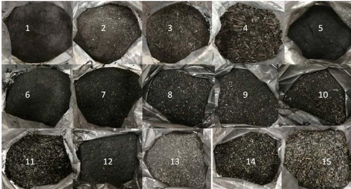
Figure 2: Mixtures used in the pelletization tests

through the pelletizing machine producing a sort of powder. When the moisture of the mixture was enough to produce the pellet the yield of pellet, given by the ratio between the pellet produced and the 400 grams used as input material was about 40%w/w. This means that about 60%w/w in weight of the used mixture remained inside the pelletizing machine.