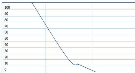
Figure 1: main mineral composition of standard sand

The soil used in the test is international standard sand (GB / T 17671-1999) certified by ISO9001, with particle size divided into three grades: coarse sand at 1.0-2.0 mm, middle sand at 0.5-1.0 mm, fine sand at 0.08 ~ 0.50mm, each accounting for 1/3. Thus the grade distribution is good. An appropriate quantity of standard sand are taken to carry out relevant geotechnical experiment and microscopic experiment. The basic physical property index and mineral composition of the sand obtained is as shown in Table 1. The particle size distribution of the standard sand is shown in Figure 1 below.