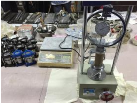
Figure 3: Unconfined compression apparatus

In the study of the leaching characteristics, long-term static circulation leaching, semi-dynamic (Tank) leaching and batch leaching were adopted. The effects of the kinds and concentrations of heavy metals on mechanical properties such as strength of solidified soil were studied, and the strength prediction models for heavy metal concentration, MKPC and curing age under the influence of specific acid rain were established. PH value of filtrate: the pH value of solution was measured by PHS-3C precision desk-type acidity meter produced by Shanghai Rex Analytical Instrument Factory; The initial pH value of artificial acid rain can be related to the pH value of the filtrate after leaching. The key factors affecting the solubility of heavy metals in solidified soil in acid rain were determined by measuring the pH and strength of solidified soil before and after leaching.