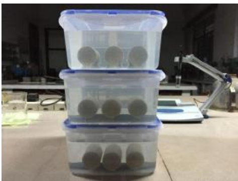
Figure 4: Static circulation leaching experiment

In the study of the leaching characteristics, long-term static circulation leaching, semi-dynamic (Tank) leaching and batch leaching were adopted. The effects of the kinds and concentrations of heavy metals on mechanical properties such as strength of solidified soil were studied, and the strength prediction models for heavy metal concentration, MKPC and curing age under the influence of specific acid rain were established. PH value of filtrate: the pH value of solution was measured by PHS-3C precision desk-type acidity meter produced by Shanghai Rex Analytical Instrument Factory; The initial pH value of artificial acid rain can be related to the pH value of the filtrate after leaching. The key factors affecting the solubility of heavy metals in solidified soil in acid rain were determined by measuring the pH and strength of solidified soil before and after leaching.