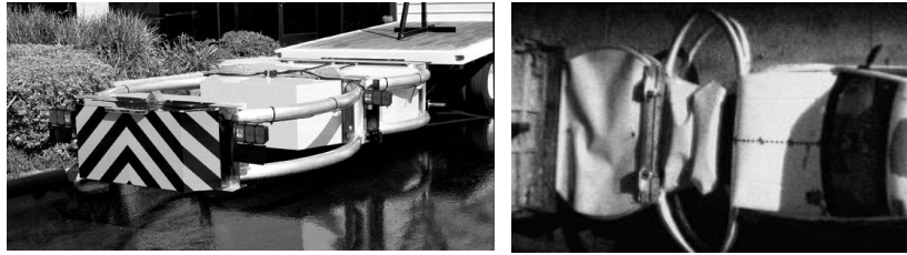
Figure 4: Truck Mounted Attenuator (left), and crash test results (right).

Granted that, in this case also, the discussed measures signaling the yard are necessary, the Risk reduction possible through the adoption of the TMAs results from the reduction of FC, since the possibility of irruption of vehicles out of control into the working area is limited; asides, the safety of drivers is increased.