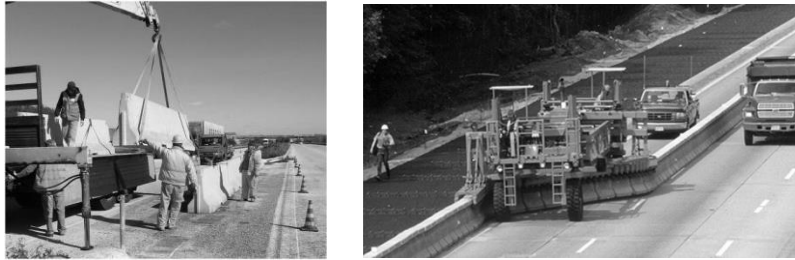
Figure 3: Barrier transfer: traditional procedure (left), mechanized “Barrier Zipper” technique (right).

In case of mobile linear yards, the usual segregation of the working areas from the traffic, based on Jersey barriers, involves that the progressive modification of the yard area makes also necessary the modification of the barriers layout. The traditional procedure (Figure 3 left) implies that the yard workers manually unfasten each module of the barrier, lift it up and move it to the new position by means of a crane; finally, it is necessary to reconnect the module to the already moved barrier. Workers and equipment operate in immediate proximity of the regular traffic; signage, light signals and flagman become necessary to draw the attention of the highway users. This operation is one of the most critical for the safety. The adoption of mechanized “Barrier Zippers” for Jersey barrier transfer (Rathbone, 2000) makes possible a significant Risk reduction for workers and users, see Figure 3 right; Table 4 summarizes the results of a Preliminary Hazard Analysis – PHA.