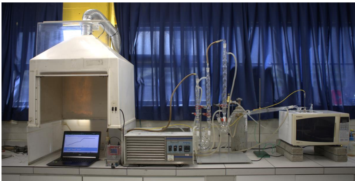
Figure 1: Overview of the microwave pyrolysis unit components.

Sugarcane bagasse was pyrolyzed in a 500 mL borosilicate glass round-bottom flask. The liquid-phase pyrolysis product was collected in a three-neck round bottom flask after condensation using three condensers cooled down by a thermostatic bath at 0 °C.