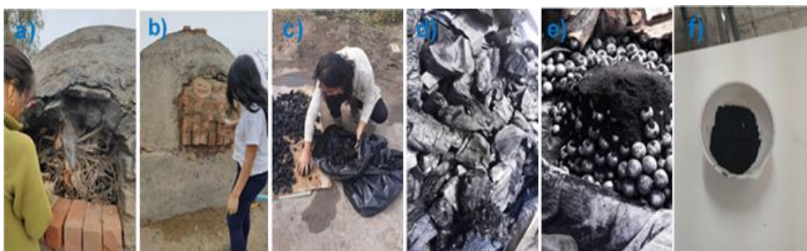
Figure 1: Production of activated biochar from Poinciana pruning. a) Filling of the pyrolyzing furnace, b) Sealing of the furnace, c) Extraction of the biochar made in 04 h by slow pyrolysis at 500 – 600 °C, d) Stabilization of the biochar before being activated, e) Activated biochar in the milling process, and f) Sample of fine biochar.

Figure 2 shows the process of making activated biochar from Poinciana prunings, which was carried out by slow pyrolysis between 500 and 600 °C. Table 1 presents the physical characteristics of pruning activated biochar (Poinciana). It is observed that of the total mass of biochar, 55.77 % is converted to ash when raised to temperatures > 700 °C. On the other hand, biochar has a lower fixed carbon content than other biomasses, represented by 30.81 % and has a calorific value of 902.62 kcal/kg. The particle size of the biochar was 44 μm, classifying it as a powdered activated biochar. Other researchers such as Zaw et al. (2018) made biochar from pruning residues of Japanese pear trees, containing 9.7 % volatile material, 80.5 % fixed carbon and 9.8 % ash, and which had a processing time of 2 h. Abenavoli et al. (2016) made biochar from olive and hazelnut pruning residues, and their physical characterization showed a fixed carbon content of 78.1 % and 90.1 %, respectively. Ash production was between 6.2 to 18.8 %, with a processing time of 3 h.