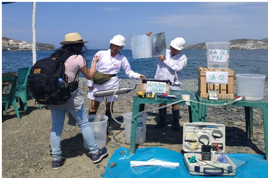
Figure 3: In-situ salinity reduction treatment

chlorides was reduced from 19,505.50 mg/L to 28.6 mg/L, with an efficiency of 99.85 %. The other parameters such as electrical conductivity, turbidity, sodium, alkalinity, phosphates, dissolved oxygen, sulfates, total solids and dissolved solids also had significant reductions in their values. While, BOD and COD had an increase in their values due to biological oxidation and chemical oxidation of the compounds present in the water, which increase in the exposure period during treatment (Carrillo and Pulido, 2018).