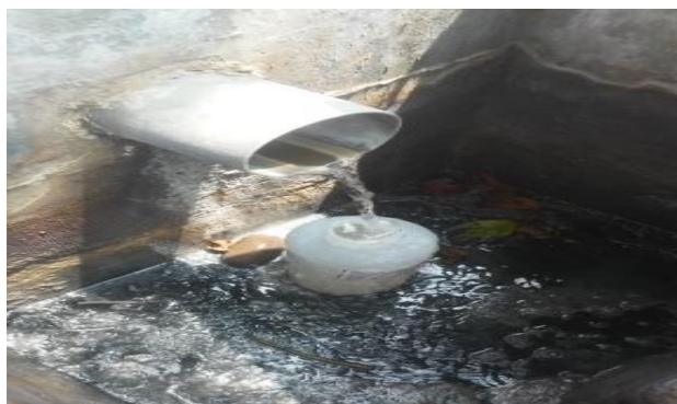
Figure 1: Sampling of effluent from an upflow anaerobic sludge blanket reactor (UASB) of the septic tank type

A sample was taken from the effluent of an upflow anaerobic sludge blanket reactor (UASB) of the Septic Tank type, as shown in Figure 1, which operated with an approximate flow of 3600 L/day. At each sampling point, single samples were taken in duplicate, the volume of each sample was one liter, although smaller volumes were used in the laboratory. The sampling procedure was carried out according to USEPA method 525.2 (1995) (Peña-Álvarez & Castillo-Alanís, 2015). The analysis was performed the same day the sample was taken.