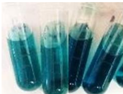
Figure 1: Coloring of the samples after performance of activity assay for laccase in dark green.

Laccase activity was spectrophotometrically determined by measuring oxidation of 2,2'-azino-bis(3-ethylbenzothiazoline-6-sulfonic acid) diammonium salt (ABTS) at 420 nm. For the assay, 1mM ABTS and 100 mM sodium acetate buffer were used. The activity test was performed by adding 1000 \mu L of acetate buffer to the free or immobilized enzyme. Just before the measurement, 200 \mu L of ABTS was added, the content was stirred for 1 min using vortex, and after exactly 1 min, the absorbance of the sample was measured at 420 nm on the UV/Vis spectrophotometer. The blank sample contained 1 mL of acetate buffer and 200 \mu L ABTS. Figure 1 shows the coloring of the samples after the performance of activity assay for laccase in dark green.