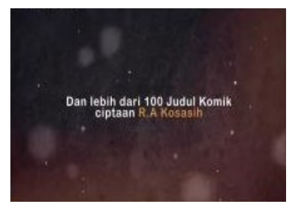
Figure 30. The intertitles informing hundreds of works of R.A. Kosasih (Ahdan, 2019, 19:18)