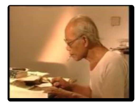
Figure 1. Pram, a complex individualist (Srikaton, 1995, 04:14)

Pram who is reading and smoking in his working room at night as indicated below.