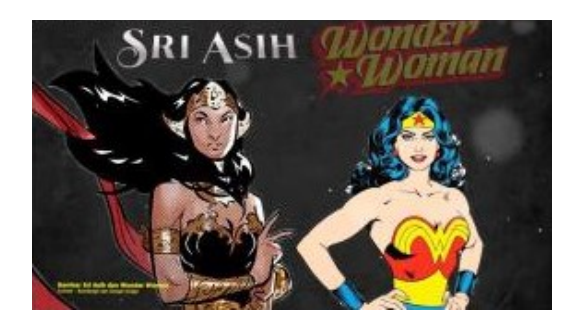
Figure 39. The tonal montage in use, juxtaposing R.A. Kosasih's Sri Asih (1954) and William Warston's Wonder Woman (1941) (Ahdan, 2019, 14:58)

As to the montages used in the film (Eisenstein, 1977), Ahdan's film also shares similarity to those of Ki Hadjar Dewantara . The dominant montages applied are tonal and rhythmical montages. The filmmakers make use of tonal montage in the following shot as an example.