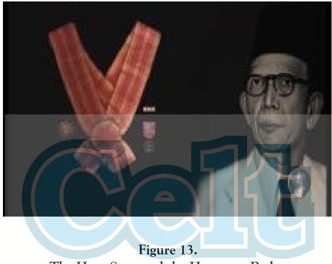
The Hero Stars and the Honorary Badge of Ki Hadjar Dewantara (Anshoriy, 2017, 43:11)

The documentary voice articulates a notion that the significant merits of Ki Hadjar Dewantara in the fields of politic, education, and culture in pre-and around independence times of Indonesia are undeniable. Throughout the film, these merits are well described and find their confirmation at the concluding segment where the bestowal of several titles, a National Hero, Pre-Independent Hero, and The Founding Father of Education in Indonesia accordingly. The film shows the Hero Stars and the Honorary Badge. Furthermore, his birthday on May 2 has been celebrated as the Education Day in Indonesia since 1959.