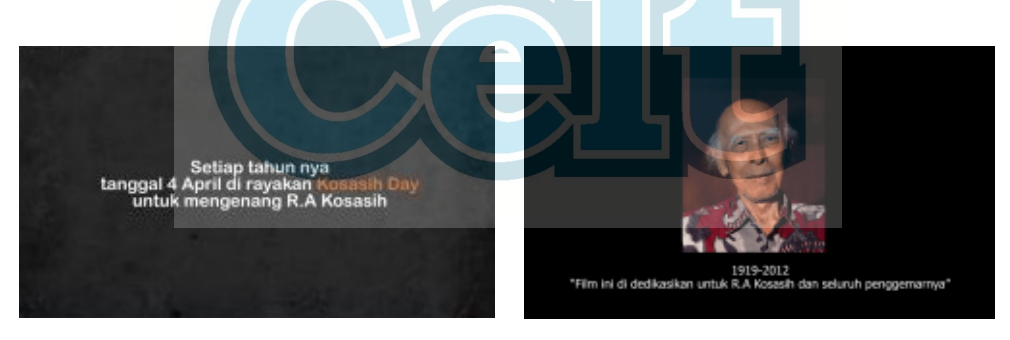
Figure 40. The commemorative shot of R.A. Kosasih (Ahdan, 2019, 19:26)

The audience could observe the rhythmical montage of the film in many segments. The most obvious one is in segment 8, the exhibition of R.A. Kosasih's popular comic books, as represented figures 26-30. The shots in these figures demonstrate different images run in sequential order with exact tempo of each shot for about 8 seconds. Additionally, the scoring (musical illustration of the visual) of all these shots is played on repeatedly with its award winning-like music. Such an audio-visual organization expresses the idea of appreciation, honor, and gratitude for producing such phenomenal comic works. This idea is even more materialized in the film as the commemorative and dedication shots following the above popular comic books scene appear on screen.