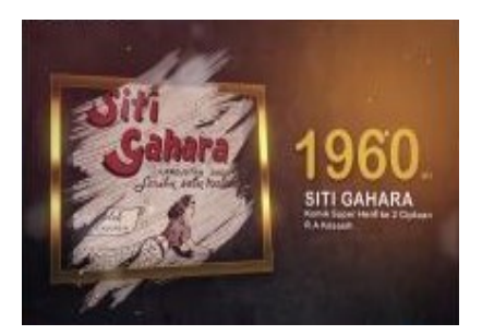
Figure 29. Siti Gahara , 1960 (Ahdan, 2019, 19:10)

Figure 28. Mahabharata, 1955 (Ahdan, 2019, 19:05)