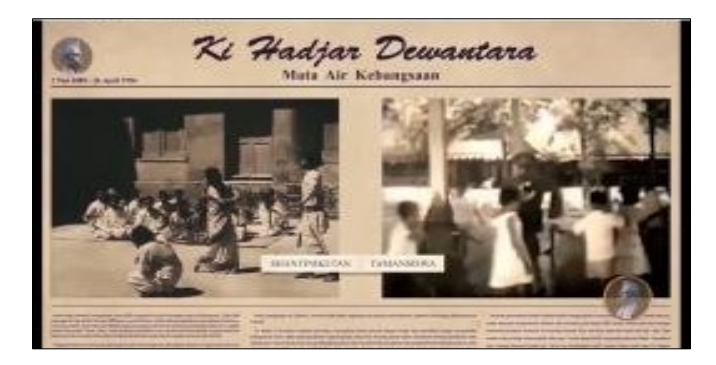
Figure 22. The tonal montage in use, juxtaposing the shared belief in cultural and educational strategies of Rabindranath Tagore's Shantiniketan in India and those of Ki Hadjar Dewantara's Taman Siswa in Indonesia (Anshoriy, 2017, 21:34)

Adhyanggono, G. M., Between the Documentary Voices and the Storytelling 165 Methods of Four Indonesian Biographical Documentaries