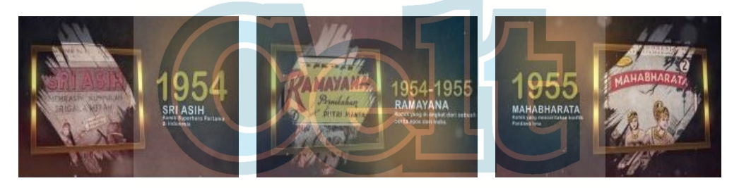
Figure 26. Sri Asih , 1954 (Ahdan, 2019, 18:46)

With regard to the filmmaker's voice (Önen, 2021), Bapak Komik Indonesia-Biografi R.A. Kosasih (Ahdan, 2019) communicates an idea that R.A. Kosasih is a true father of Indonesian comic for he has created the first Indonesian superhero comic in Indonesian style, Sri Asih , and that all of his comic works also gained popularity for more than a decade. This is vividly indicated in several scenes throughout the film. They are in segment 1, 2, 5, 6, and 8. As a case in point, segment 8 shows the most popular works of R.A. Kosasih as represented below.