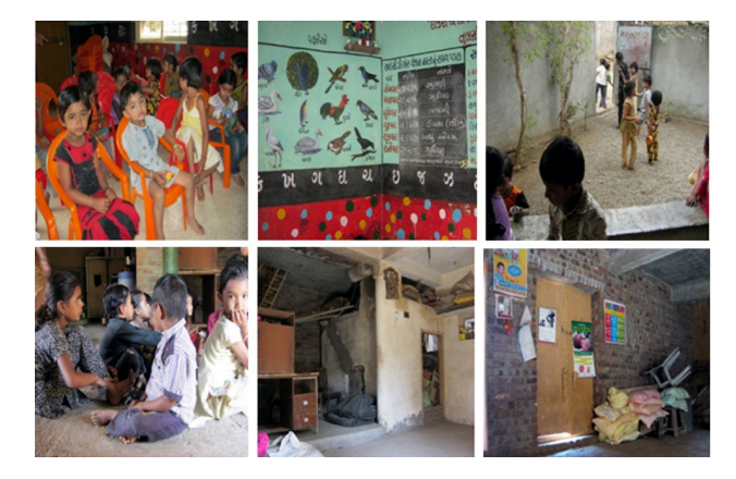
Fig 2. AWCs for 'Upper' Caste (Top Row) and Dalit (Bottom Row) Children Respectively

The AWC devoted largely to Dalit children was located within a non-Dalit settlement in a rented building owned by the deputy sarpanch belonging to a Brahmin household (Fig 2). It had an AWW of Dalit caste. It also had on its roll a small number of children belonging to the caste-Hindu groups. Dalit and non-Dalit children huddled separately and non-Dalit children were observed to have restricted interactions with Dalit children. A few households residing in this area sent their children to other AWCs in the village, with the convenient arrangement that an AWH of another AWC, who happened to live in the area, would escort their children, each morning, on her way to the AWC.