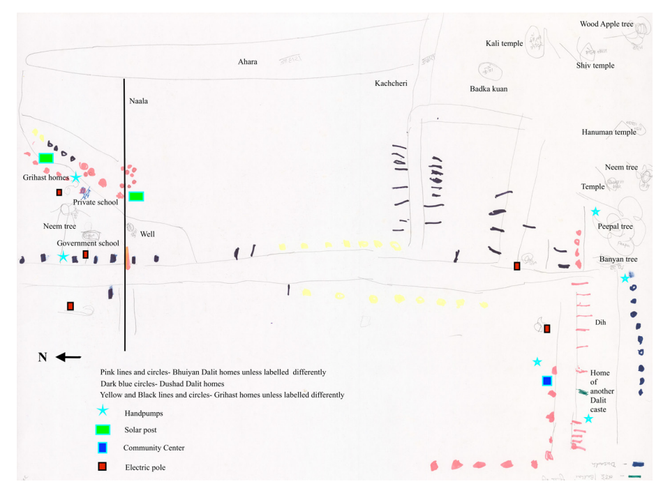
Figure 1: Map of Kaari drawn by Bhuiyan Dalit women showing spatial arrangements of housing, including the dih in the southwest (lower right), and location of resources east of the center of the village (vertical black line at left represents the naala [rivulet]) (December 2012)

In this section, I describe where each of these features were presented on Bhuiyan Dalit women's maps and in their accompanying narratives and analyze the implications for how untouchability practices have changed over time. Figure 1 shows an incomplete map of Kaari hand-drawn by Bhuiyan Dalit women in one of the latter mapping sessions. I have added symbols showing the location of resources that were not depicted in this particular map but were marked in other maps drawn on the ground. This is to assist the reader in following analysis of these features below.