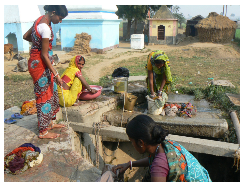
Figure 4: Non-Dalit women washing clothes at the badka kuan (March 2014)

Figure 3: Map showing location of two hand pumps in the new mixed-caste neighborhood in northern Kaari. Each of the three mapmakers in this session had their own chalk color (May 2012).