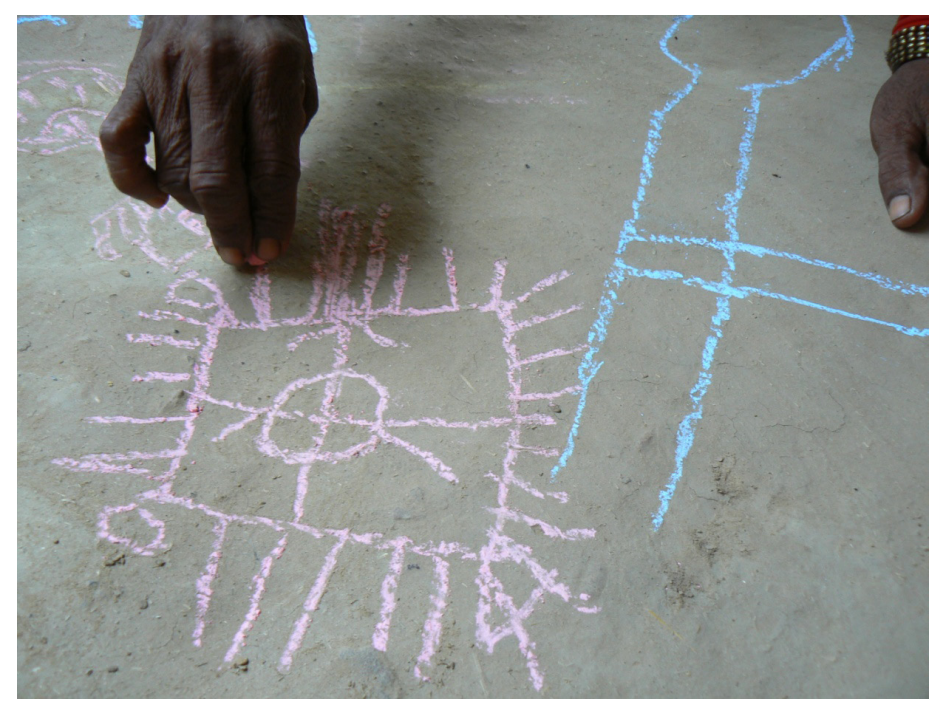
Figure 2: Bhuiyan Dalit woman sketching badka kuan (main village well) covered with thorny branches (May 2012).

intended to make any such statement, their construction of a well certainly challenged the terms of associated life and undermined grihast control over resources necessary for survival. Unfortunately, the wells in the dih were much shallower than the badka kuan , so they dried up every summer. By the time I was conducting field research, they were no longer in use.