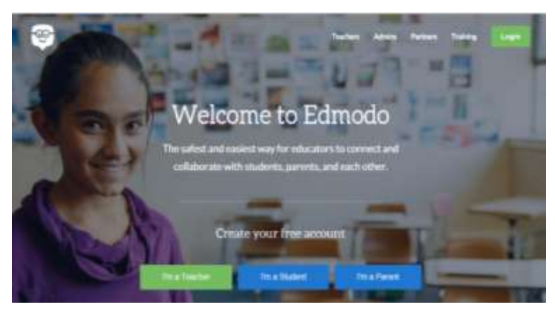
Figure 3 Edmodo home page