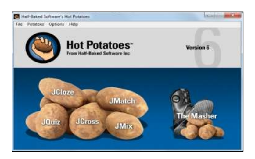
Figure 1 The 6<sup>th</sup> version of Hot Potatoes