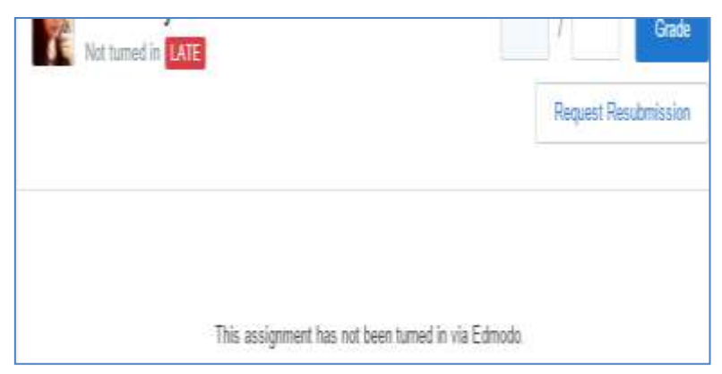
Figure 5 The Edmodo's late submission notification