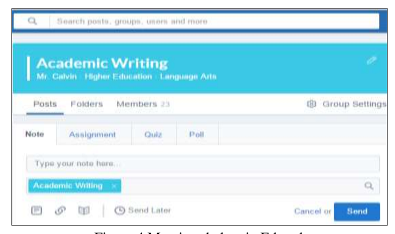
Figure 4 My virtual class in Edmodo