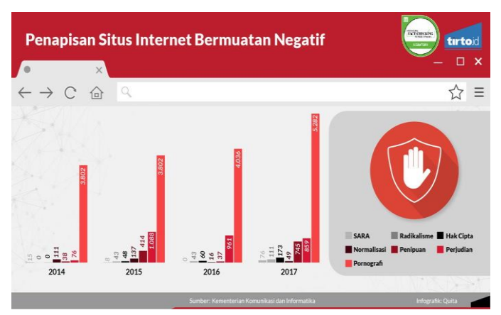
Fig. 1. Negative Internet Site Screening Graphic

Negative impact caused by pornography to adults is gender believe [5]. In general, pornography has effect to weaken function of each individual and social in the type of mind, body, and heart [6]. Meanwhile, for largest portion of adolescent accesses pornography content is male who already have puberty [7]. In the research, it shows that pornography has negative effect towards learning, which is about content and dynamics of sexual interaction, gender mapped to the sexual relationship, sexual agreement, normalization to the gender violence, and sexual script that create femininity and masculinity.