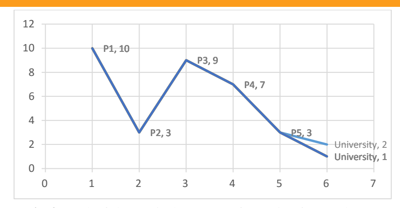
Fig. 3. Graph of changes in the amount of porn sites from each case.

Based on Fig. 3, it can be seen that different color line show research K1-K5 conducted towards porn sites that still able to be accessed as well as provider and application in university. It can be seen each of them, P1-P5, has no change towards its number of porn sites can be accessed, where it is shown from color of K1-K5 research that overlapped each other. Meanwhile, in accessing sites through university, it shows a change. There is change from two sites that still able to be accessed become only one site that still able to be accessed. Then, in Fig. 4, it shows change towards number of porn sites that still able to be accessed from the whole research.