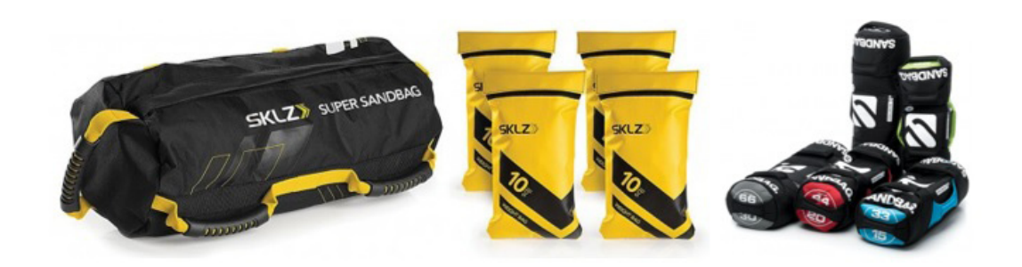
Figure 1 Different models of sandbags

was not until the beginning of the last century that it was recognized as a legitimate form of physical training. There is ample evidence that the sandbag was used as a sports material, which capitalized on physical exercises in well-structured training, especially by Indian wrestlers who practiced Pehlwani<sup>1</sup> (a form of sports competition that arose through the combination of two established ancient melee styles: Malla-yuddha<sup>2</sup> and Varzesh-e Bastani<sup>3</sup>). Pehlwani comes from South Asia and is considered a complete form of fighting in India.