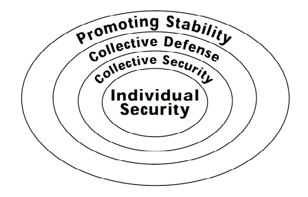
Figure 1 The "four-ring model" of cooperative security<sup>11</sup>

The model proposed by Cohen also known as the four-rings model <sup>9</sup> because it consists of four concentric rings that subscribe to international legitimacy and credibility by promoting individual security, collective security, collective defence and international stability as recognized and guaranteed by the provisions of the Charter of the United Nations<sup>10</sup> (Figure 1).