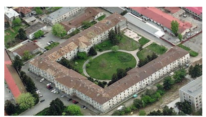
b - current view

After the unification of the principalities, along with the measures for the development of the army, there was a need to create specialized bodies and clear and unitary regulations for the construction and administration of the military barracks and