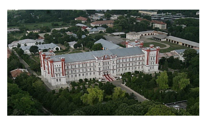
b - view from 2000