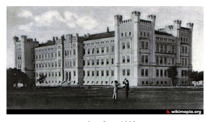
a - view from 1900