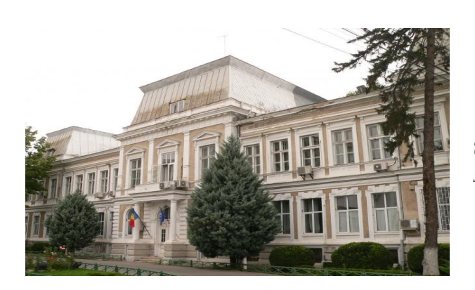
Figure 2. Central Military Hospital, Bucharest