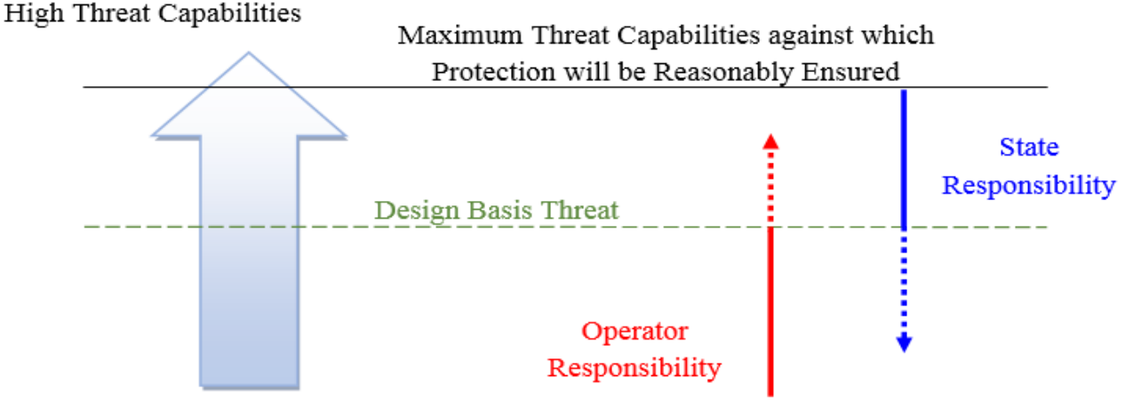
Low Threat Capabilities

elements that could facilitate an attack (e.g. For the development of the DBT, one of the the existence, in the vicinity of the protected sites,