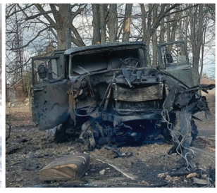
Figure no. 2 Zil-131 trucks destroyed in Russia's offensive against Ukraine, 2022