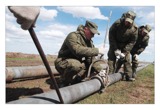
Figure no. 5 Russian military servicing a military structure with the role of fuel supply implementing specific infrastructure