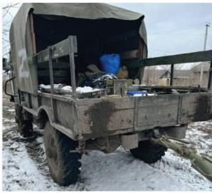
Figure No. 3 Gas-66 trucks destroyed in Russia's offensive against Ukraine, 2022