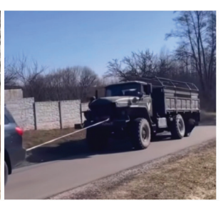
Figure No. 4 Ural-4320 66 trucks destroyed in Russia's offensive against Ukraine, 2022

și Bartles 2016, 329-332). The strength of this battalion is the time it takes to install the pipelines, up to 3 or 4 days after occupying the territory.