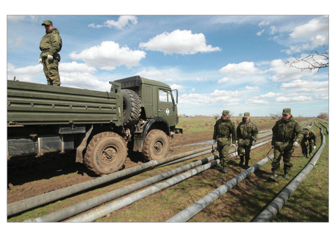
Figure no. 6 Russian servicemen serving a military structure with the role of providing fuel by implementing specific infrastructure

were documented long before a conflict began, with Operation 'Z' supporting these assertions with clearly observable facts all along the Ukrainian front. An evocative description of Russia that also