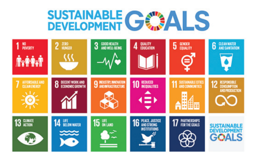
Figure no. 1 Sustainable development goals (European Commission 2021)

as access to energy, resilience. infrastructure, sustainable use of oceans and inclusive economic growth (United Nations 2014). Sustainability and security are given an important place alongside the traditional poverty reduction goals that were already part of the MDGs. Considering the rather ambitious agenda, with 17 sustainable development goals, supported by 169 targets, the aspects related to the SDGs implementation and financing will be quite complex, both for developed and developing countries (Kamphof, Spitz and Boonstoppel 2015).