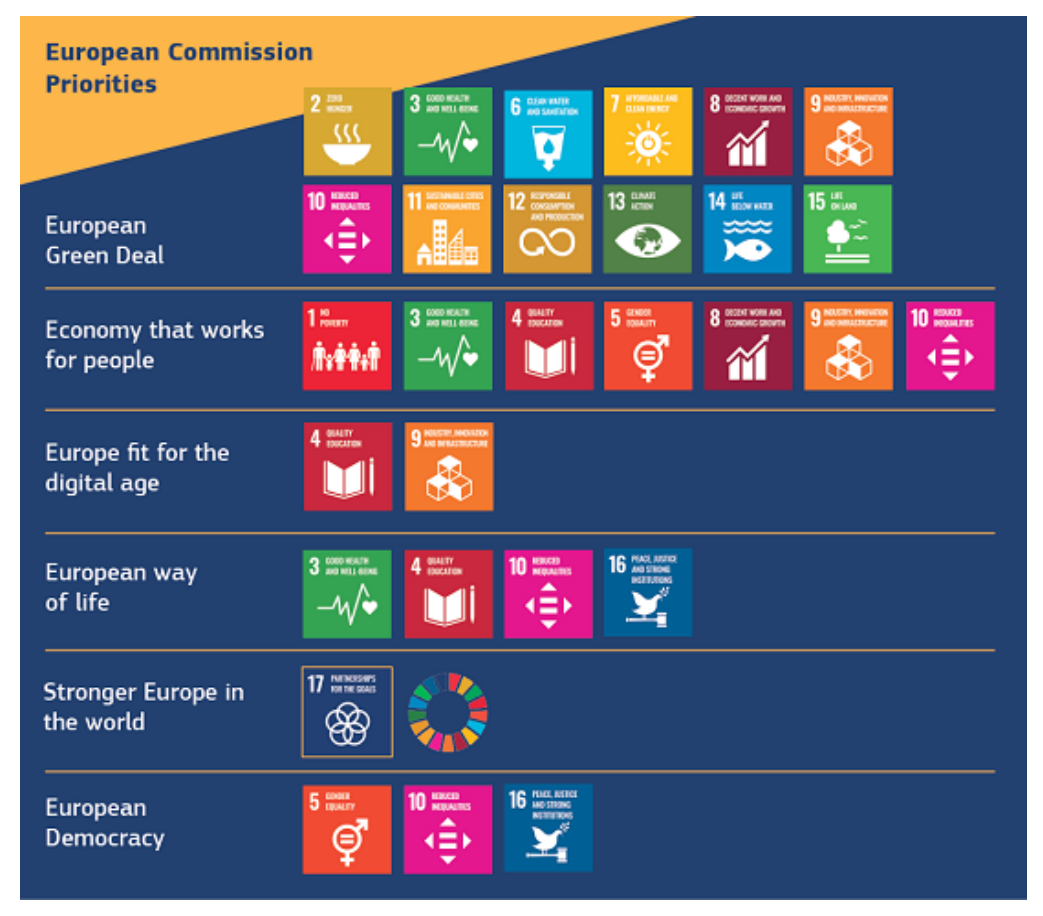
Figure no. 2 The European Commission sustainable development Priorities (European Commission n.d.)

The European Union development objectives were prioritized and structured on six major directions of action, as can be seen in figure no. 2. The European Commission focused on actions that will lead to concrete progress in the areas of sustainable development objectives.