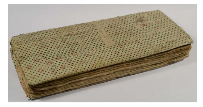
Figure 5 - Memory Book of the Kolegov Merchants, NLR, Ms. Dep., O. XVII. 84

The second document, the Memory Book of the Kolegov Merchants , is kept in the Manuscript Department, NLR; it is a small bound volume in octavo (figure 5).