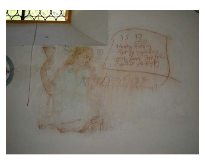
Figure 5 – This memorial inscription for Marta Kolb was written after her death on the Southern wall of the St. Vigil church, Obsaurs, Northern Tyrol.

Both examples, the graffiti of the Gräfinger couple at the Fernstein Chapel and the inscription recording Marta Kolb in Obsaurs, are part of a very similar setting: both are found on a chapel