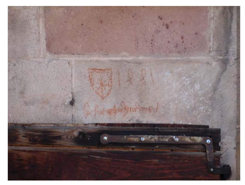
Figure 6 – A certain Erhard placed his name, coat of arms and the date of his visit in 1441 on the walls of the church at Gries, Bozen/Bolzano.

stone (figure 6). It has not been possible to read his full surname and the coat of arms could not be identified in the relevant compendia on heraldry in the region, leaving us with not much to conclude from the inscription other than the date and the use of an all-too-common German name in the region.