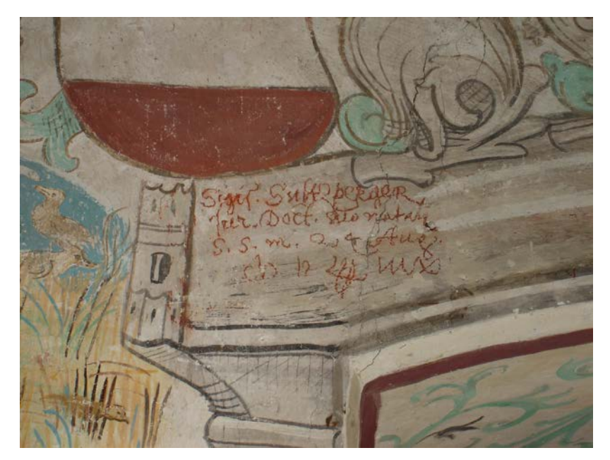
Figure 1 – The graffito by Sigismund Sultzperger in Frundsberg Castle, Schwaz, Northern Tyrol.