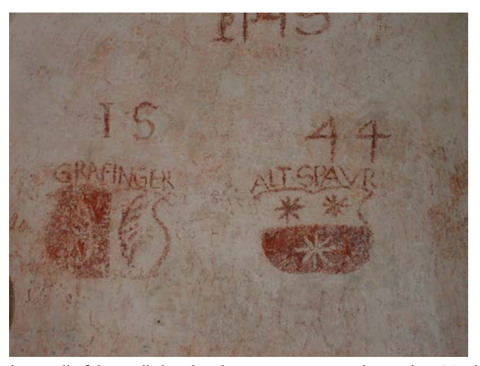
Figure 4 – The Northern wall of the small chapel at the Fernpass, Nassereith, Northern Tyrol, shows the coat of arms of the Gräfinger and the Altspaur families.