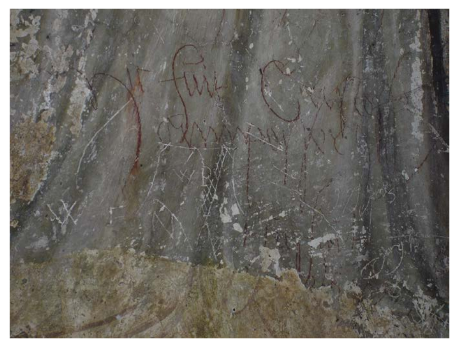
Figure 9 – Several graffiti from Hall in Tirol show the picture of gallows with pending letters (initials?). This example with ladder can be found in the choir paintings of the Church of Our Saviour.

are not the same but vary in every graffito: 'BK', 'MG', 'IH', 'WP'). Placing these signifiers of a person in the place of the hanged and using a sacred space for the graffiti would indicate that a curse might be a possible explanation for these graffiti. Or did someone wish for the rescue of a beloved one, condemned to death on the gallows? Hall, after all, had a place of execution and was home to a professional hangman (Moser 1982). A third interpretation could make these drawings a form of prayer for the hanged after their death, helping them in the afterlife and testifying as to the remembrance of the condemned after their execution. It is interesting to think that the gallows in Hall (so far, no other examples of this iconography have been found in the Tyrol) are in all three scenarios, a reflection of the nature of the other graffiti they complemented. All of them tried to connect the writer and his message – mostly in the positive sense of a perpetuation of presence close to the divine – to the other world.