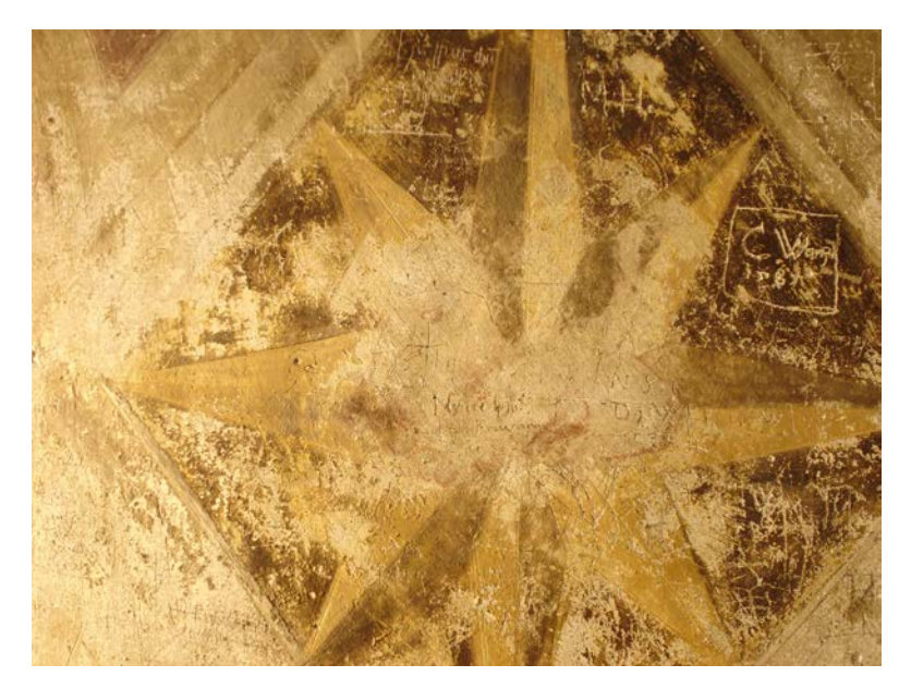
Figure 8 – Amongst the many graffiti in the Church of Our Saviour, Hall in Tirol, Northern Tyrol, one graffiti writer placed a devil's head here, well visible on the left ray of the underlying star.

Schmitz-Esser 2013, 170, cat. no. 164).<sup>12</sup> The apotropaic content is obvious. The interpretation of a small devil's head in the lower part of the fresco in the Church of Our Saviour in Hall in Tirol is more difficult (figure 8). The profile of the devil's head comments on the thematic strand of the fresco above, showing the Last Judgement and a demon pulling on one of the rising dead to take him to Hell. Thus, the graffiti writer might have thought of commenting on or contemplating the fresco's main message. Matthew Champion has included an English example in his recent work on graffiti, too (from Beachemwell, Norfolk, see Champion 2015, plates in between pages 114 and 115, seventh figure), so that we can confidently state that this devil is not unique. However, in the case of the head in Hall, the eye is over-emphasised, making it possible that the graffiti was attacked at its 'weakest' point to restrain the power of the image. Such practice of mutilating the devil's image is well documented in medieval book illuminations (Camille 1998), and it is striking that a painted devil above its graffiti counterpart in the fresco from Hall is not as well preserved as the rest of the painting.