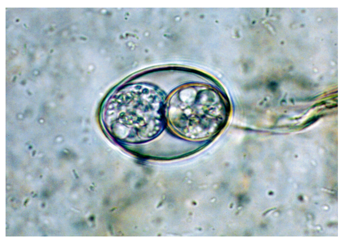
Figure 1. Cystoisospora felis sporulated oocyst. Sugar saturated solution. 1000X.

ground spleen, cat II – ground liver, cat III – ground cloacal bursa, and cat IV - suspension of 10^6 sporulated oocysts/mL. Beginning the day after inoculation, fecal samples were examined daily for infection as described by Figueiredo et al. (1984). For Oocyst sporulation, fecal samples were collected and diluted separately, and stored in plastic vials containing potassium dichromate 2.5% in water solution in a proportion ratio of 1:9 (v/v), which was placed under forced aeration using a aquarium pump and at ~22°C.