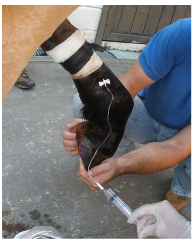
Figure 2. Regional intravenous perfusion with gentamicin.

bearing of the left hind during rest. By day 10 post RIP, the lameness improved to grade 2/4.