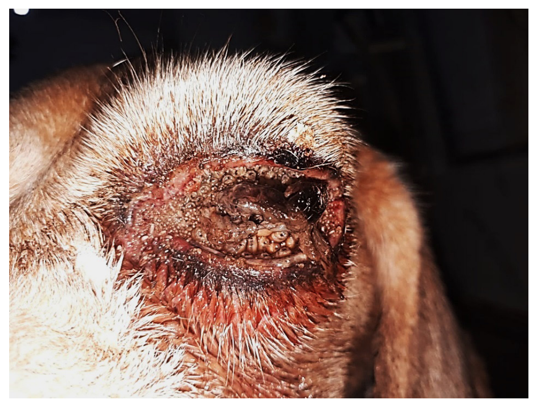
Picture 1. Extensive myiasis in left eye bulb region by Coclhiomyia hominivorax larvae. Note the high degree of parasitism with larvae stage L1 on the medial eyelid commissure and L2 and L3 as it moves toward the lateral eyelid commissure.

Success of nitenpyram in the treatment of ocular myiasis in the orbital cavity of a dog – case report