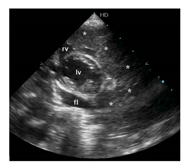
Figure 1. Right transversal parasternal view in echocardiographic examination, highlighting the presence of a large structure (*) attached to the heart. Other structures referenced: right ventricle (rv) and left ventricle (lv). Note the presence of free liquid (fI) in the thoracic cavity.

Subsequently, a radiographic examination of the chest had been performed in the ventral-dorsal and right & left lateral positions, which revealed pleural effusion and a general increase in radiopaqueness. The procedure of thoracocentesis was performed with aims at providing respiratory comfort to the patient, though with a small amount of liquid drained. The echocardiogram had been conducted from a Phillips (HD-7) device, with a 3-8 MHz sector transducer, which confirmed the presence of free liquid in the thoracic cavity and highlighted the existence of a major heterogeneous structure attached to the heart (Figure 1).