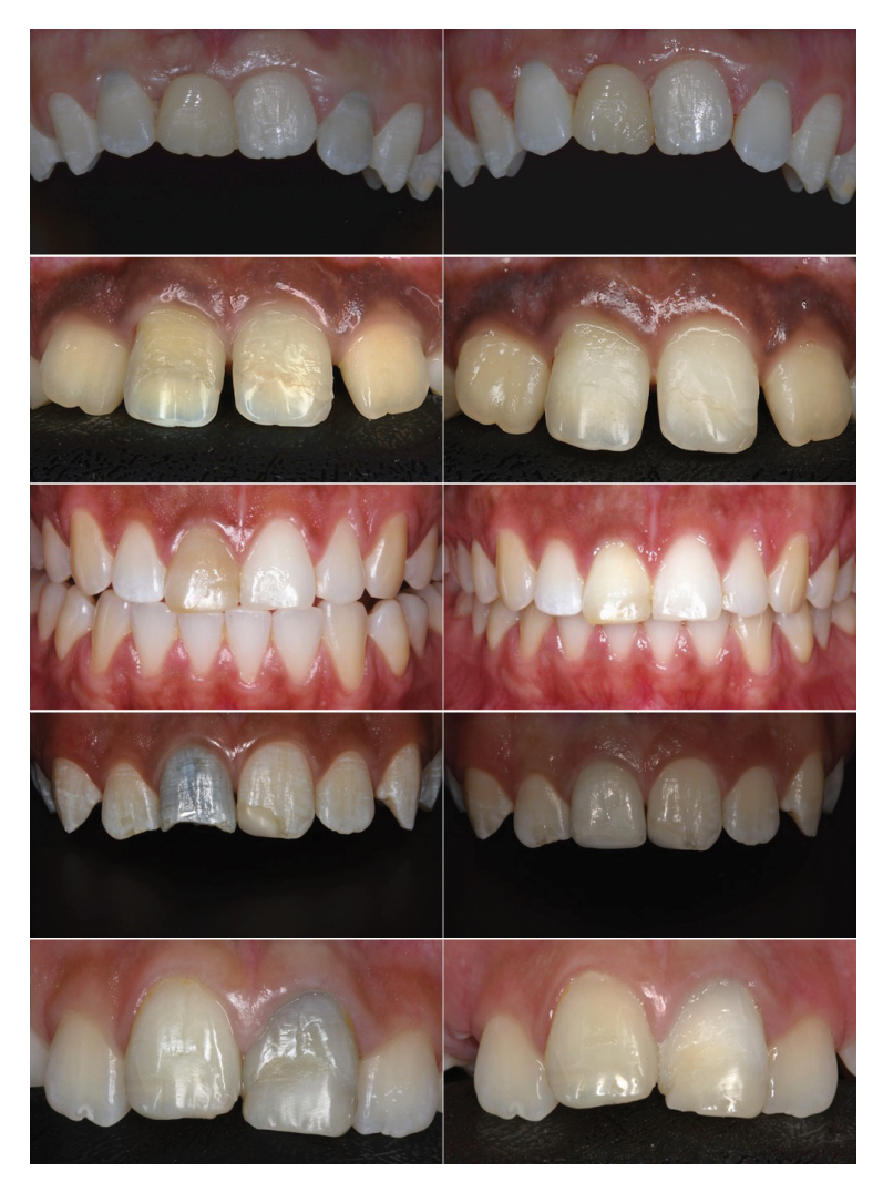
Figure 3 . Clinical appearance of the cases included in the study. (A,C,E,G,I) Clinical appearance before internal bleaching, where it is possible to observe the crown discoloration of the incisors submitted to the regenerative endodontic procedure; (B,D,F,H,J) Clinical appearance 14 days after the last internal bleaching session.

The number of sessions required to achieve satisfactory results was similar between groups, ranging from one to three sessions (Table 1).