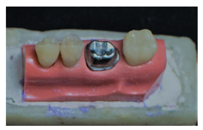
Figure 1. The metal die (copy of the mandibular left first molar prepared for a complete metaloceramic crown) adapted to the left mandibular hemi-arch.

metaloceramic crown with a 1-mm chamfer finish line and a taper of approximately 5 degrees was cast in a base metal alloy and adapted to the left mandibular hemi-arch (Fig. 1). A standard crown was fabricated for the prepared die to represent the form of the tooth prior to preparation (Fig. 2). A matrix planned for provisional fabrication was used to copy the contours from the standard crown adapted to the metal die. This matrix was extended onto at least one tooth adjacent to the teeth being restored. The impression materials were divided into four groups: irreversible hydrocolloid (IH), laboratory silicone (LS), condensation silicone (CS), and addition silicone (AS). Twelve impressions were taken for each impression material. This impression served as a matrix for making the provisional crowns for all materials applied: Alike, Duralay, Protemp 4, and Structur 3 (n=12). A verticulator (Bio-art Equipamentos Odontológicos Ltda., São Carlos – SP, Brazil) was used to standardize the path of insertion and removal of the partial stock tray and the applied force (Fig. 2).