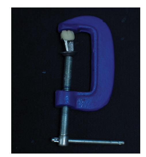
Figure 3. Temporary crown adapted to the metal die with a "C" clamp.

ginal discrepancy of the provisional crowns was determined by measuring the space (marginal opening) between the margin of the provisional crowns and the finish line of the metal die. For each provisional crown, the measurements were made at four vertical reference lines previously marked at the midpoint of the metal die finish line at four locations to represent the buccal, lingual, mesial, and distal surfaces of the die. The measurements were made three times along the long axis of the die at each of the four reference points. All procedures were performed by one operator calibrated.