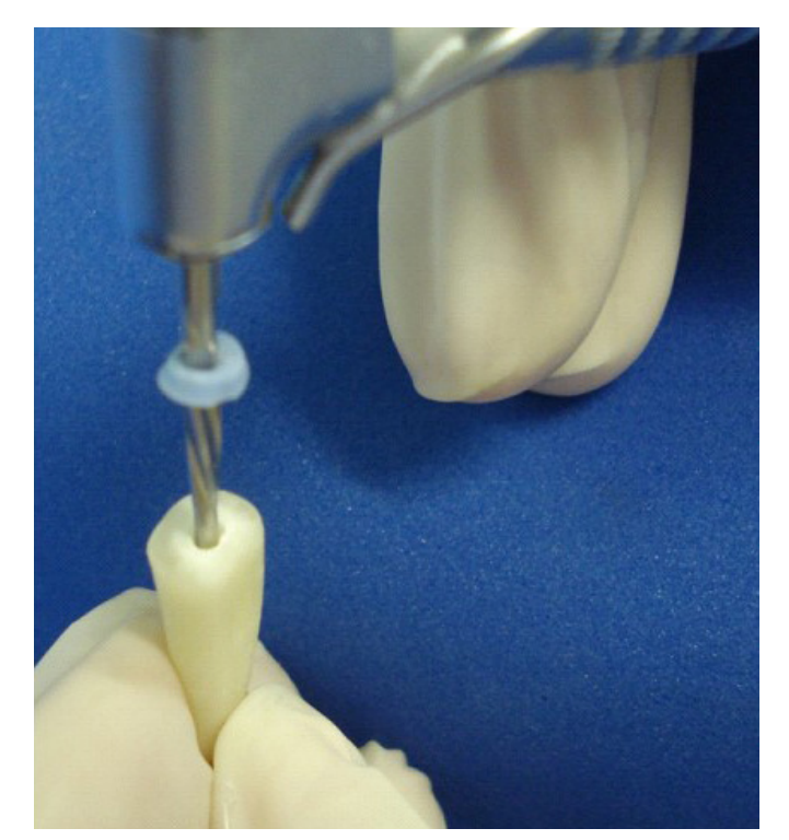
Fig.1. Roots prepared with specific bur.