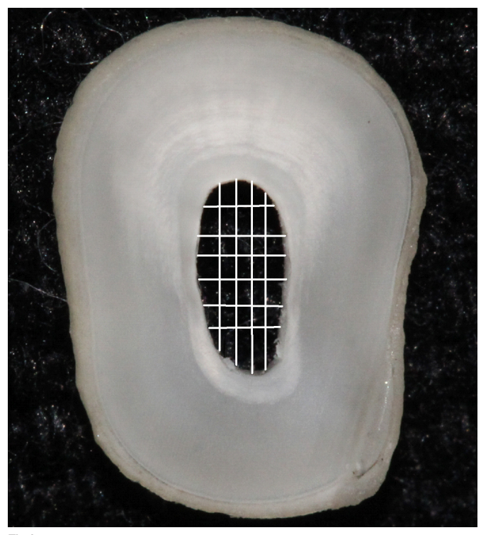
Fig.2. Photograph of canal slice and measurement of internal diameter with software in 10 different regions.