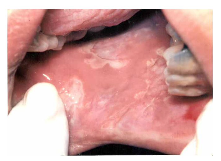
Fig. 2: Pemphigus vulgaris oral lesion (buccal mucosa)