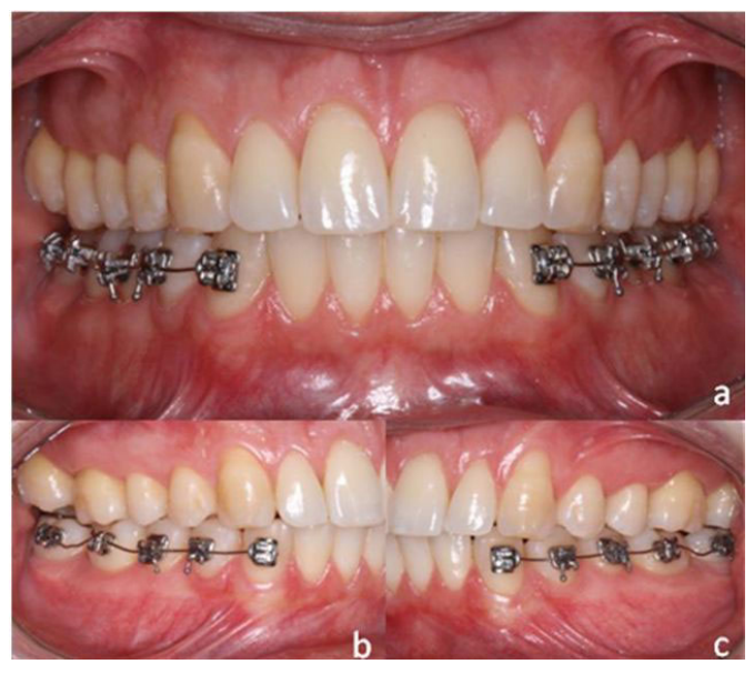
Fig. 2. a) Intraoral frontal view of one of the patients, in whom brackets were bonded; b) right side view (brackets used for bacterial plaque collection); c) left side view (brackets used for SEM evaluation).