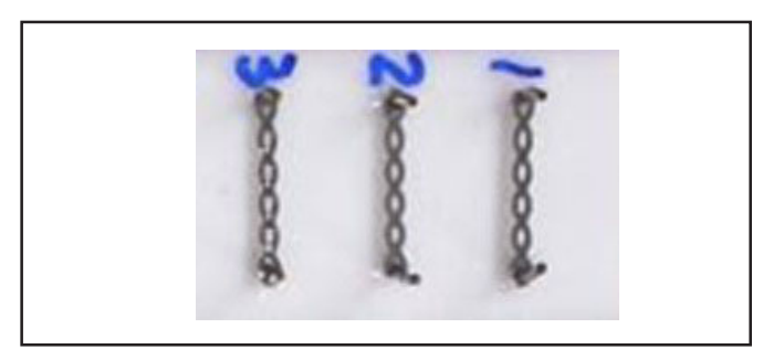
Fig. 1 - Test specimen (Plastic chain) stretched on plate.

To simulate the mechanism of orthodontic retraction, 15 plates (3 mm thick x 30 mm wide x 150 mm long) were made of resin, divided into 3 groups, each of which was composed of 5 plates according to the material to be tested. Into these plates, 10 pairs of stainless steel orthodontic wire pins measuring 1.2 mm in diameter (Morelli, Sorocaba, SP, Brazil) were inserted. The pins were arranged in parallel pairs. The samples were inserted into each pair in such a way that their tips were distended during the evaluated test periods (Figure 1).