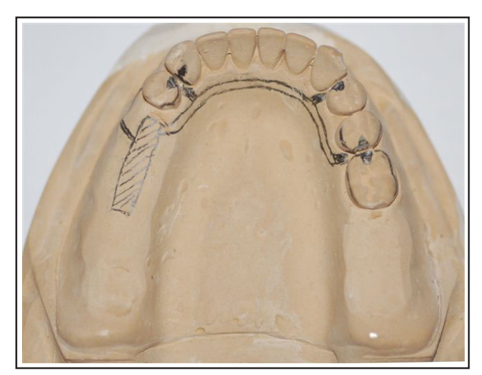
Fig. 3. RPD framework drawn on the study cast to transmit this information to the prosthodontic technician.

information to the technician, since subsequent transfer of two-dimensional information by the technician from the paper diagram to the three-dimensional cast can lead to errors of interpretation (Figure 3)<sup>4</sup>. Clarification of the design diagram may be achieved by using a color code to identify different RPD components or functions.