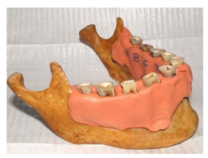
Fig. 1. Specimens mounted in a jaw and attached with silicone impression material for positioning the scanner.

The working length (WL) was established at 15.0 mm. The CMP was performed according to the manufacturer's recommendations (Table 1). In GW were first used #013 and #016 PathFiles (Dentsply-Maillefer) to obtain the glide path of the root canal; in GP the glide path was obtained with #10 and #15 hand files. In both groups, irrigation/aspiration at each file exchange was performed with 5.0 mL of 1% NaOCl using a disposable syringe and needle. After completing CMP, a final flush was done with 3.0 mL of