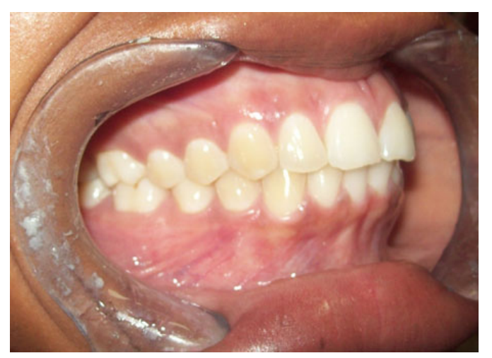
Fig. 1b - Profile intra-oral view of a participant with class I normal occlusion