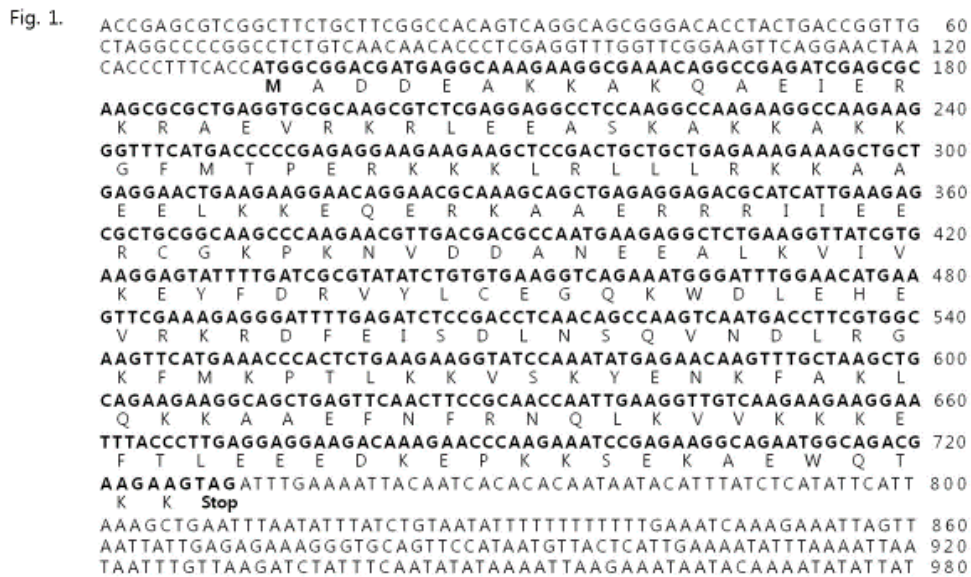
Figure 1. Sequence analysis of GrybiTnI cDNA. Nucleotide sequences of the cDNA encoding GrybiTnI isolated from two-spotted cricket ( Gryllus bimaculatus ) and its deduced amino acid sequences are shown.

We amplified a cDNA of troponin I (TnI) from the fifth-instar larvae of the two-spotted cricket ( Gryllus bimaculatus ) (named GrybiTnI ). This cDNA was cloned with an RT-PCR approach using Conserved Domain Databases (NCBI, Bethesda, MD, USA) and Motif Databases (GenomeNet, Kyoto, Japan). The amplified GrybiTnI cDNA was composed of a short 5' untranslated sequence of 132 bp, a single open reading frame (ORF) of 351 bp, and a 3' untranslated sequence of 194 bp. Its ORF region began with a start codon at position 133 and terminated with a TAG stop codon at position 729. It encoded a protein of 198 amino acids. Its predicted molecular mass was 23.67 kDa with a theoretical isoelectric point of 9.78 (Figure 1).