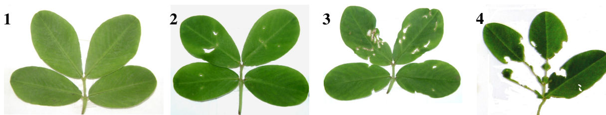
Figure 2. Scale of visual symptoms of attack by S. bosquella : 1. Absence of visual symptoms of attack, 2. Small holes in some leaves, 3. Small holes in all the leaflets, 4. Leaflets severely damaged.