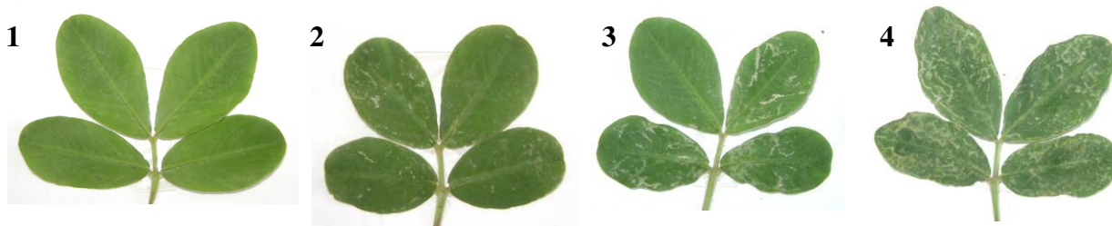
Figure 1. Scale of visual symptoms of attack by E. flavens : 1. Absence of visual symptoms of attack, 2. Beginning of silvering symptoms on the leaflets, 3. Silvering and early curling of the leaflets, 4. Silvery and shriveled leaves.

and reproductive variables were transformed to \arcsin[(x+5)/100]^{1/2} .