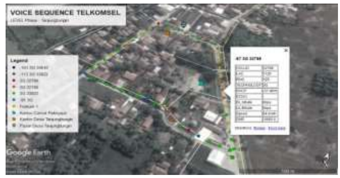
Figure 3. Drive Test Process Map on GNet Track Pro

After that, the data from the test drive is processed in the form of mapping (Google Earth) and cumulative data in tabular format. In the mapping image, what appears in colored dots is the area traversed during the drive test process.