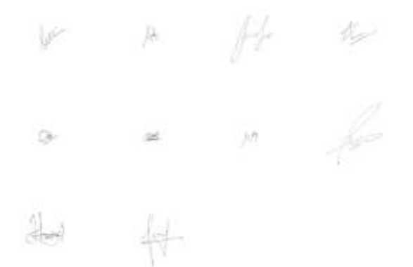
Figure 3. Sample Signature

The test carried out aims to determine the results of the level of accuracy. In Figure 3 below, an example of a signature that will be used in research: