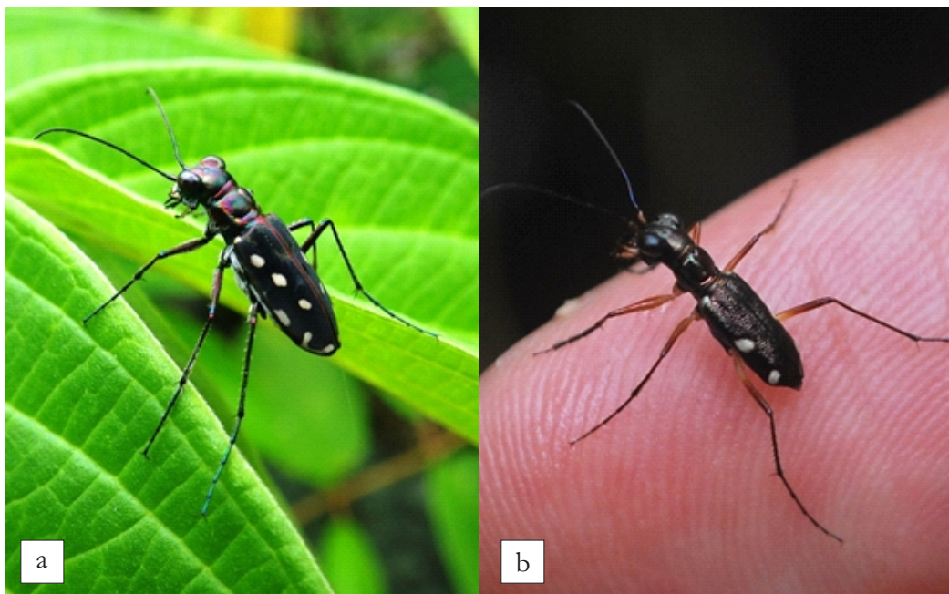
Figure 2 Endemic species (a) Calomera mindanaoensis ; (b) Prothyma (Symplecthyma) heteromallicollis heteromallicollis

Cylindera and Calomera were all found in the open and sandy riverbanks and caught using both light trapping and hand netting methods. These four genera were found to inhabit open and sandy riverine ecosystems, agreeing with Dangalle et al. (2012). Species of the genera Therates , Neocollyris and Tricondyla were often found perching or running in the shrubs and trees near rivers preferring shade rather than exposed open areas. These species were easily caught using a hand net or by hand. Species from the genus Therates were especially found in close proximity to river banks while the species from the genera Neocollyris and Tricondyla were found along the roads and some were near creeks and rivers.