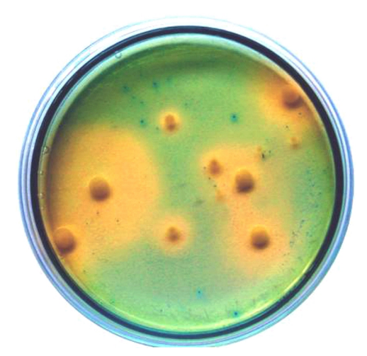
Figure 1 Production of siderophores by tomato rhizobacteria on CAS agar was indicated by yellow-orange color around colony of bacteria

Siderophore-producing Rhizobacteria and potential antagonistic activity toward Ralstonia solanacearum - Nawangsih et al.