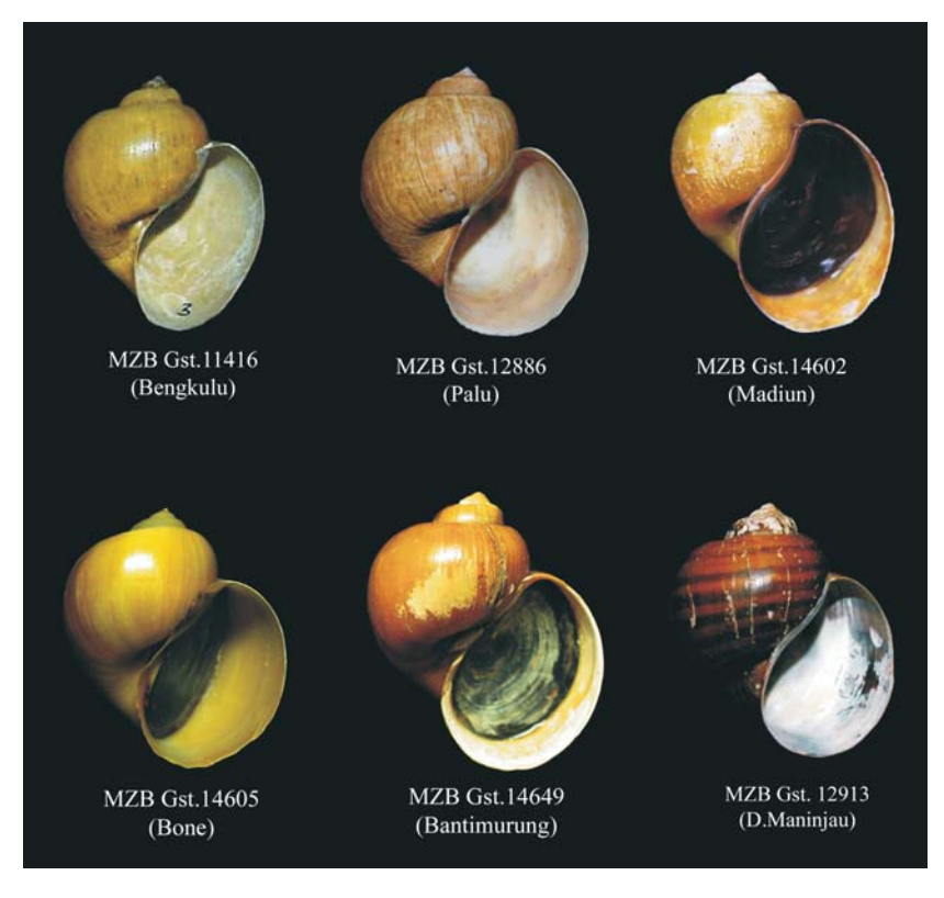
Fig. 2. Shell variation of Pomacea canaliculata from different localities.

Measurements: Height of shell 12.58 - 69.66 mm; width of shell 4.94 - 64.90 mm; height of body whorl 11.20-61.20 mm; length of aperture 8.58 - 49.7 mm; width of aperture 6.50 - 34.31 mm.