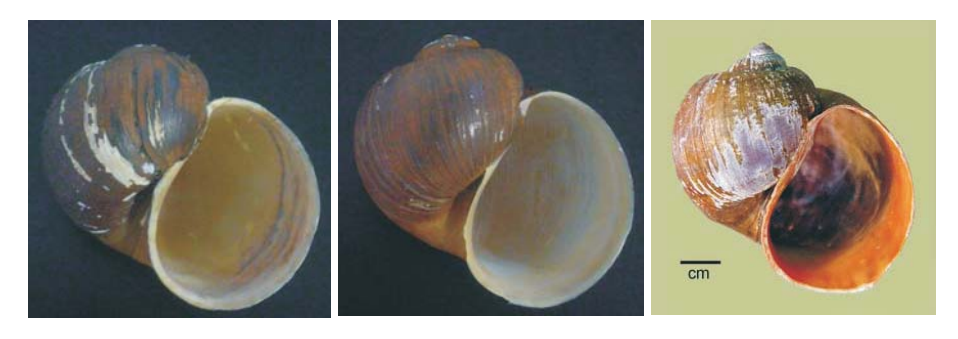
Figure 3. Shell variation of Pomacea insularum from Lake Loa Kang.

Measurements: Height of shell 66.16-85.00 mm; width of shell 63.32-79.6 mm; height of body whorl 64.60-77.55 mm; length of aperture 46.05-59.25 mm; width of aperture 33.24-44.45 mm.