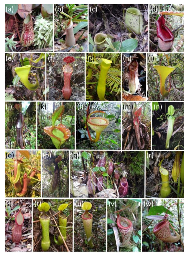
Figure 3 Nepenthes species recorded from West Sumatra: (a) N. adnata (lower pitcher), (b) N. albomarginata (lower pitcher), (c) N. ampullaria (rosette pitcher), (d) N. bongso (lower pitcher), (e) N. dubia (upper pitcher), (f) N. eustachya (lower pitcher), (g) N. gracilis (upper pitcher), (h) N. harauensis (lower pitcher), (i) N. inermis (upper pitcher), (j) N. izumiae (upper pitcher), (k) N. jacquelineae (upper pitcher), (l) N. jamban (upper pitcher), (m) N. lingulata (upper pitcher), (n) N. longifolia (upper pitcher), (o) N. mirabilis (upper pitcher), (p) N. naga (upper pitcher), (q) N. peetinata (rosette pitcher), (r) N. reinwardtiana (upper pitcher), (s) N. rhombicaulis (upper pitcher), (t) N. singalana (upper pitcher), (u) N. spathulata (upper pitcher), (v) N. talangensis (upper pitcher), (w) N. tennis (upper pitcher). Authorities are noted in Table 1

the entire global population of some of these locally endemic species. Conservation needs and responsibilities are therefore extremely high. Further exploration and formal records would add to the quality of existing assessments. Beyond assessing their conservation status, the key threats to the majority of Nepenthes in Indonesia are land-use change and collection for the horticultural trade (Clarke et al. 2018; Cross et al. 2020), so practical conservation methods need to address these challenges that will only be successful with the support of local communities and governments. These fascinating restricted range and threatened Nepenthes species in Sumatra need further study, especially regarding their distribution and population status. A more detailed exploration of the mountainous regions of Sumatra may well find further populations, as we have done here.