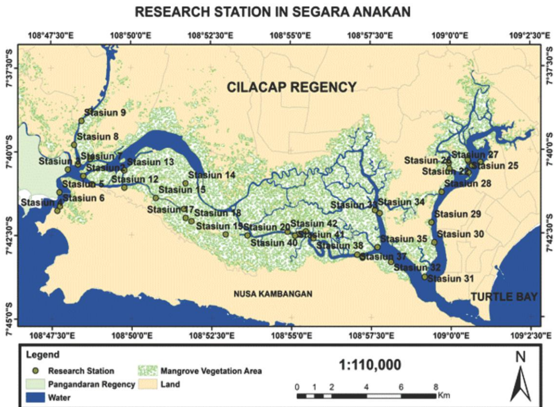
Figure 1 Research site in Segara Anakan Lagoon

This research was conducted at the Segara Anakan Lagoon (SAL), Indonesia (Fig. 1) using the cluster sampling method based on the rivers of East Segara Anakan such as Donan River, Kembang Kuning River and Sapuregel river. Ten sampling plots with geographical coordinates were used in this research (Table 1).