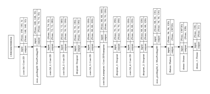
Figure 2 : The architecture of the ML neural network used to diagnose pneumonia from X-rays images .

The dataset of X-rays images have been used for ML model training (5216 image) and validation (624 images). The AlexNet architecture yielded 37% accuracy at the beginning of the design. Our ML model design is inspired by AlexNet structure, where the architecture consists of eight constitutional layers ( Figure 2 and Table 1 ).