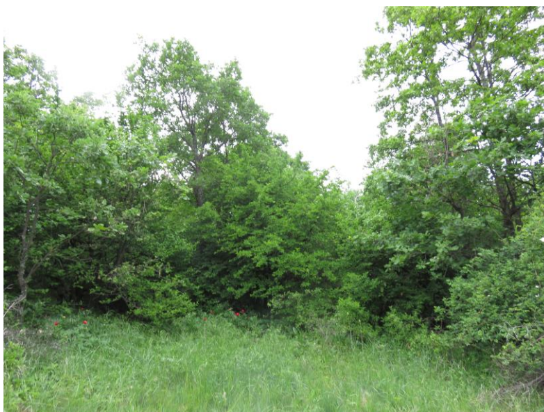
Fig. 2. C. pichleri in its natural habitat

The species is distributed in four (out of 20) floristic regions in Bulgaria – Strandzha Mt, Black Sea Coast, the Rhodopes (East) and Toundzha hilly country up to 800 m alt. The new population of C. pichleri inhabits the periphery of dry, stony meadows in termophilous oak forest and brushwood in the Natural landmark "Habitat of wild peony"