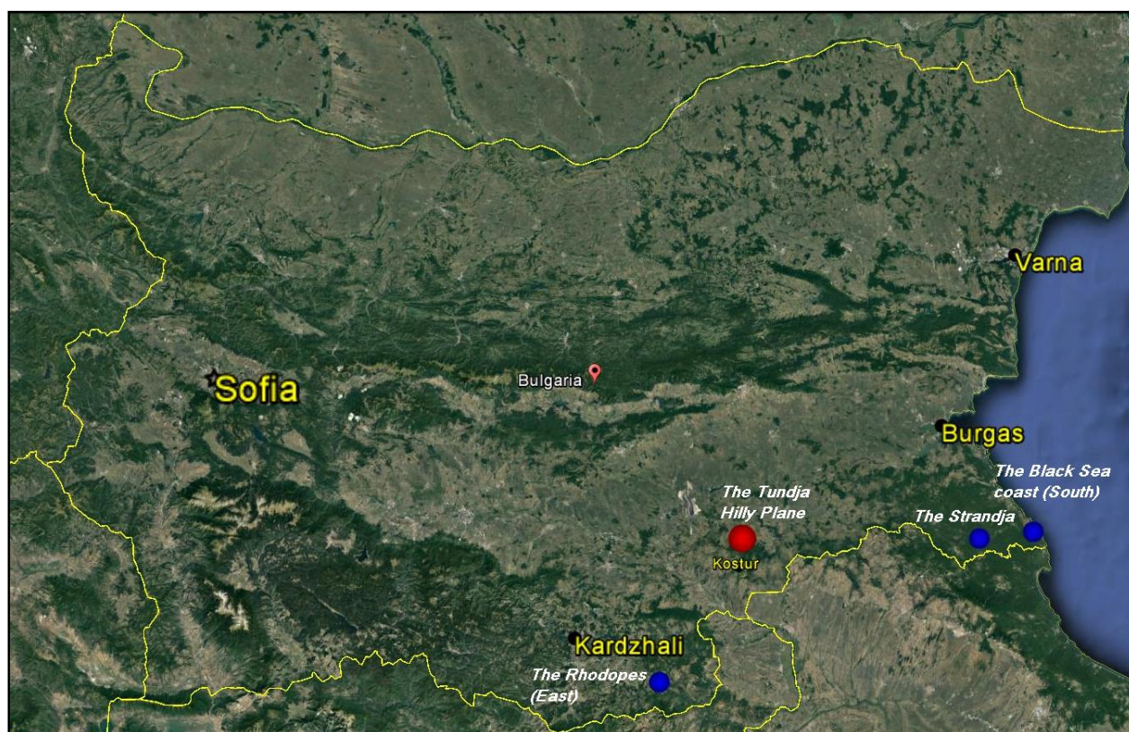
Fig. 3. Map of distribution of C. pichleri

proclaimed in 1976 (Figs 2, 3). The species grows together with: Quercus frainetto Ten., Q. pubescens Willd., Fraxinus ornus L., Carpinus orientalis Mill., Acer monspessulanum L., Anthemis arvensis L., Linaria genistifolia (L.) Mill., Paeonia peregrina Mill., Muscari botryoides (L.) Mill., Saxifraga rotundifolia L., Veronica austriaca L. subsp. jacquinii (Baumg.) Eb. Fisch., Geranium sanguineum L., Verbascum phoeniceum L., Dactylis glomerata L., Ranunculus illyricus L., Lamium purpureum L., Cornus mas L., Potentilla neglecta Baumg., Centaurea thirkei Sch. Bip., Achillea millefolium L., Lychnis coronaria (L.) Desr., Plantago lanceolata L., Hypericum perforatum L., Ajuga laxmanii (L.) Benth., Lathyrus aphaca L., Ranunculus neapolitanus Ten., Silene conica L. etc. This territory is a part of a Site of Community Importance BG0000212 "Sakar" from the Ecological Network NATURA 2000 in Bulgaria. This habitat type named "Pannonian-Balkan Turkey Oak – Sessile Oak Forests – 91M0" is included in Annex I of the "Habitat" Directive 92/43/EEC. Another specimen of Centaurea pichleri from Toundzha hilly country, south of the village of Igljika, Bolyarovo Municipality (SOM 162724), is stored in SOM, which was collected about 50 km east of the new population. This is also unpublished record of the species.