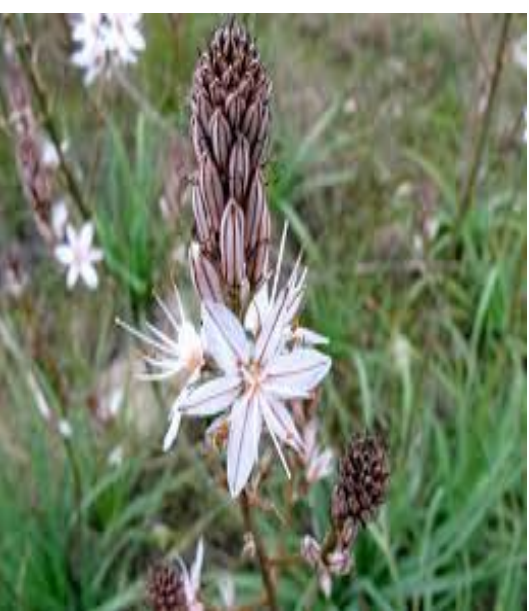
Fig. 1: The morphology of Asphodelus microcarpus