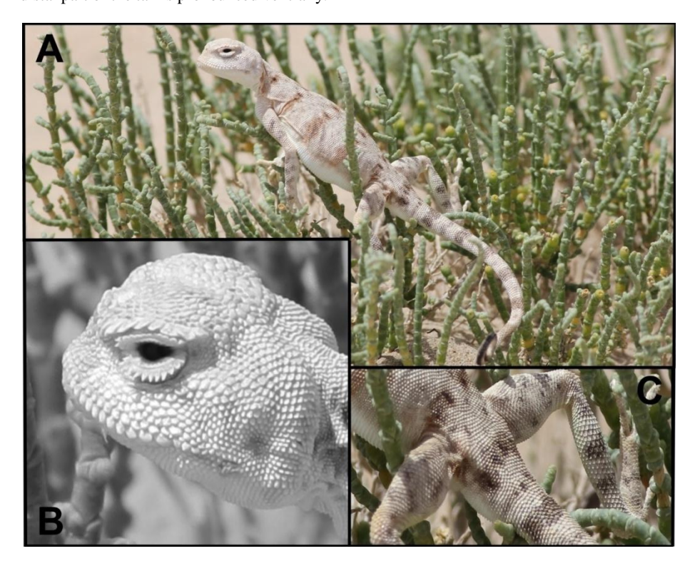
Fig.3: (A) Female Phrynocephalus maculatus longicaudatus Haas, 1957. (B) Side view of the head showing 5 rows of scales between eye and lip. And have enlarged posterior supraorbital scales larger than mid-dorsal scales typical for ssp. longicaudatus Haas, 1957. (C) Rearward view showing no fringe of scales on posterior border of thigh and

In our surveys we found one P. maculatus in each site. The first was climber on plant Haloxylon salicornicum , the other was procumbent on the sand. The phenotypic characteristics of the tow specimens coincide with diagnosis of P. m. longicaudatus Haas, 1957, (figs. 3, 4). The head is short and broad, roughly looks like a heart on top view. Forehead convex, with slightly enlarged scales, slot big mouth, no cutaneous folds at angle of mouth, no fringe of scales on posterior border of thigh and side of tail, side of head and neck without projecting fringe-like scales, dorsal scales homogeneous, no enlarged scales along flanks, scales on vertebral region considerably larger than those on flanks, nostrils are separated by one to three scales. Differs from P. m. maculatus in having posterior supraorbital scales strikingly flattened and enlarged, longer than wide, and larger than mid-dorsal scales; a few dorsal scales are keeled or with an indication of mucronation; nostrils are directed forward instead of upward; tail is longer than twice the distance from the gular fold to the vent; dark coloration of the distal part of the tail is pronounced ventrally.