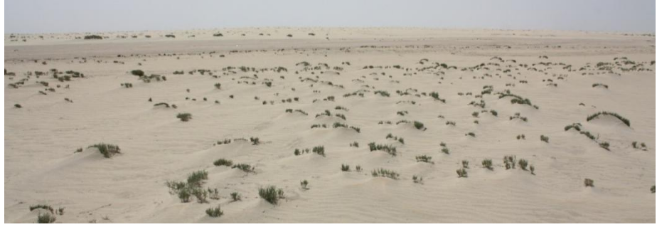
Fig.1: Habitat of P. maculatus at Um Al-Rouge area-Al-Muthanna province / South West Iraq.

In summer 2013 the Iraqi Ministry of Environment carried out a field survey to study the wild birds in the important biodiversity areas in AL-Muthanna province, which is one of the largest provinces South West part of Iraq. Most of the province is located in Ecoregion: Arabian Desert and East Sahero-Arabian xeric shrublands (PA1303) according to World Wildlife Fund (WWF), and the encyclopedia of earth. The biodiversity of this region is the least known in Iraq (Iraq fourth National Report to the Convention on Biological Diversity 2010). Many sites North, South, East and West the province were surveyed, during which two specimens of P. maculatus were collected, for the first time in late spring to the South of Al-Khader city (40Km Southeast of Al-Samawah city) in the part of sandstone North and Northeast of the province; the other one seen in mid-summer sandy area Eastern of Sawa Lake (28Km Southeast of Al-Samawah city).