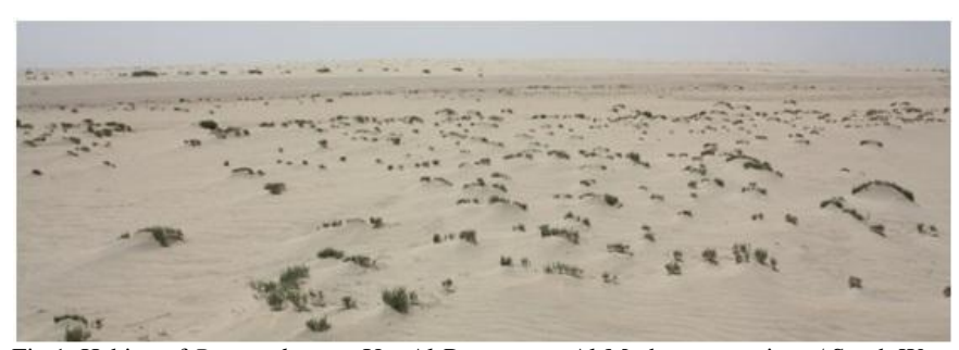
Fig. 1: Habitat of P. maculatus at Um Al-Rouge area-Al-Muthanna province / South West Iraq.

In summer 2013 the Iraqi Ministry of Environment carried out a field survey to study the wild birds in the important biodiversity areas in AL-Muthanna province, which is one of the largest provinces South West part of Iraq. Most of the province is located in Ecoregion: Arabian Desert and East Sahero-Arabian xeric shrublands (PA1303) according to World Wildlife Fund (WWF, 2014), and the encyclopedia of earth (2015). The biodiversity of this region is the least known in Iraq (Iraq fourth National Report to the Convention on Biological Diversity 2010). Many sites North, South, East and West the province were surveyed, during which two specimens of P. maculatus were collected, for the first time in late spring to the South of Al-Khader city (40Km Southeast of Al-Samawah city) in the part of sandstone North and Northeast of the province; the other one seen in mid-summer sandy area Eastern of Sawa Lake (28Km Southeast of Al-Samawah city).