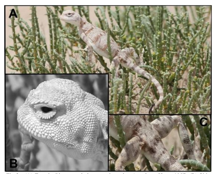
Fig.3: (A) Female Phrynocephalus maculatus longicaudatus Haas, 1957. (B) Side view of the head showing 5 rows of scales between eye and lip. And have enlarged posterior supraorbital scales larger than mid-dorsal scales typical for ssp. longicaudatus Haas, 1957. (C) Rearward view showing no fringe of scales on posterior border of thigh and side of tail. Photographs by Ali N. Al-Barazengy Um Al-Rouge area Al-Muthanna province in may 2013.

In our surveys we found one P. maculatus in each site. The first was climber on plant Haloxylon salicornicum , the other was procumbent on the sand. The phenotypic characteristics of the tow specimens coincide with diagnosis of P. m. longicaudatus Haas, 1957, (figs. 3, 4). The head is short and broad, roughly looks like a heart on top view. Forehead convex, with slightly enlarged scales, slot big mouth, no cutaneous folds at angle of mouth, no fringe of scales on posterior border of thigh and side of tail, side of head and neck without projecting fringe-like scales, dorsal scales homogeneous, no enlarged scales along flanks, scales on vertebral region considerably larger than those on flanks, nostrils are separated by one to three scales. Differs from P. m. maculatus in having posterior supraorbital scales strikingly flattened and enlarged, longer than wide, and larger than mid-dorsal scales; a few dorsal scales are keeled or with an indication of mucronation; nostrils are directed forward instead of upward; tail is longer than twice the distance from the gular fold to the vent; dark coloration of the distal part of the tail is pronounced ventrally.